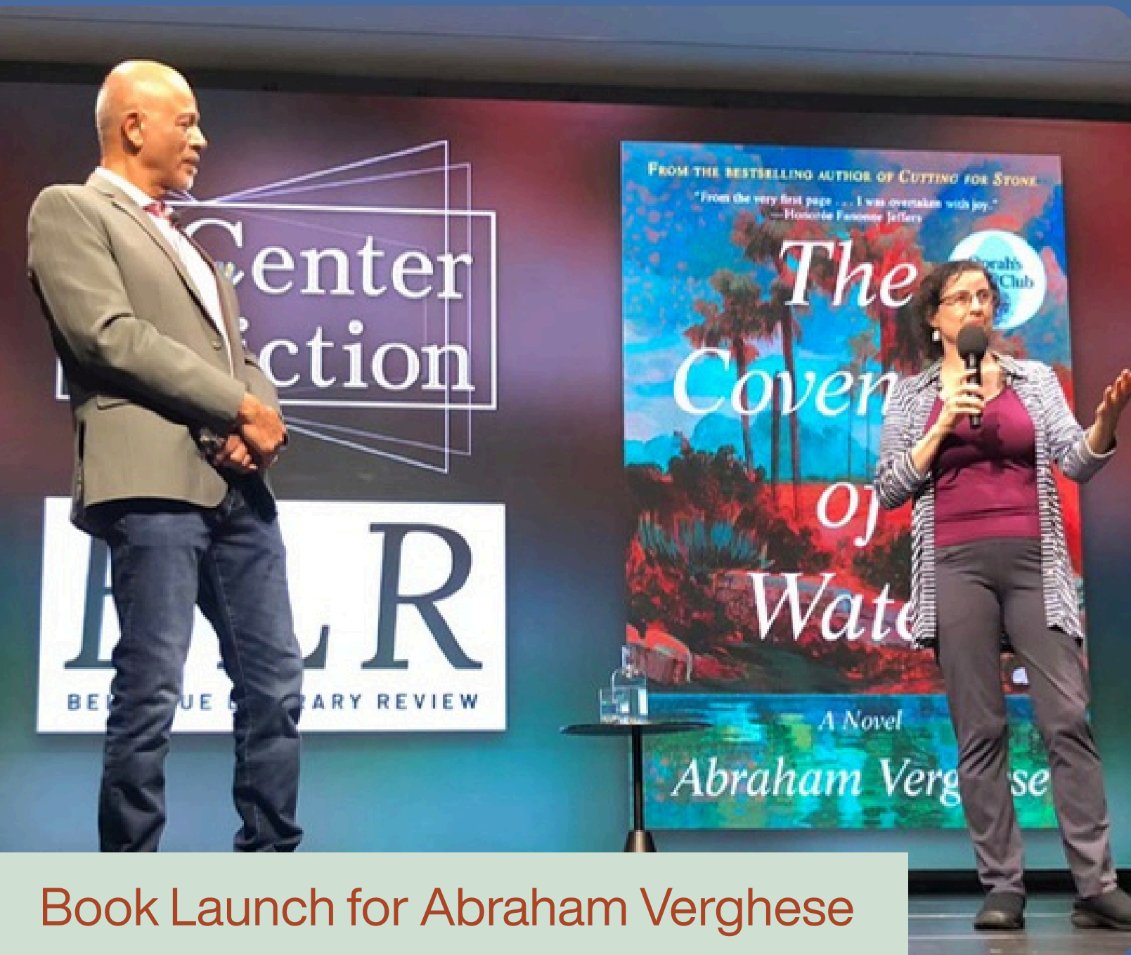
Book Launch for Abraham Verghese