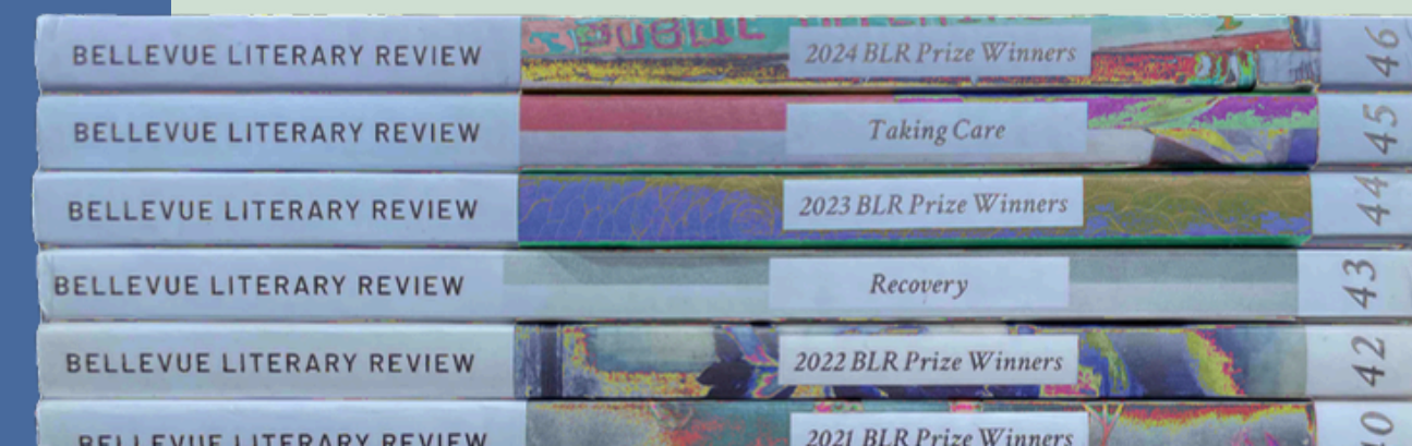
BLR Book Salon with Anne Fadiman